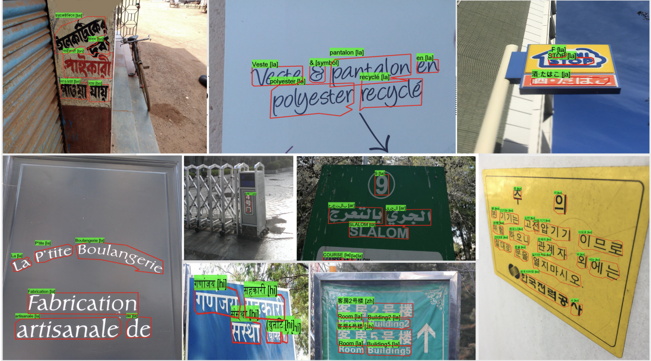
Figure 3. Qualitative results on MLT19. The polygon masks predicted by our model are shown over the detected words. The transcriptions from the selected recognition head and the predicted languages are also rendered in the same color as the mask. The language code mappings are: ar - Arabic, bn - Bengali, hi - Hindi, ja - Japanese, ko - Korean, la - Latin, zh - Chinese, symbol - Symbol.